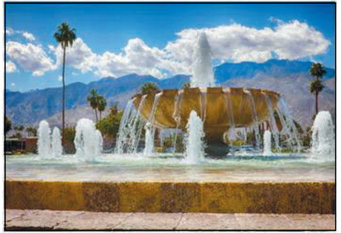
Fountain at Palm Springs International Airport.

By this method, one could take virtually anything and do the same—even the “golden arches” at McDonald’s! The Encyclopedia Americana (article: “Arch”) says the use of arches was known in Babylon as early as 2020 B.C. Since Babylon was called “the golden city” (Isa. 14:4), can there be any doubt about the origin of the golden arches? As silly as this is, this is the type of proof that has been offered over and over about pagan origins.